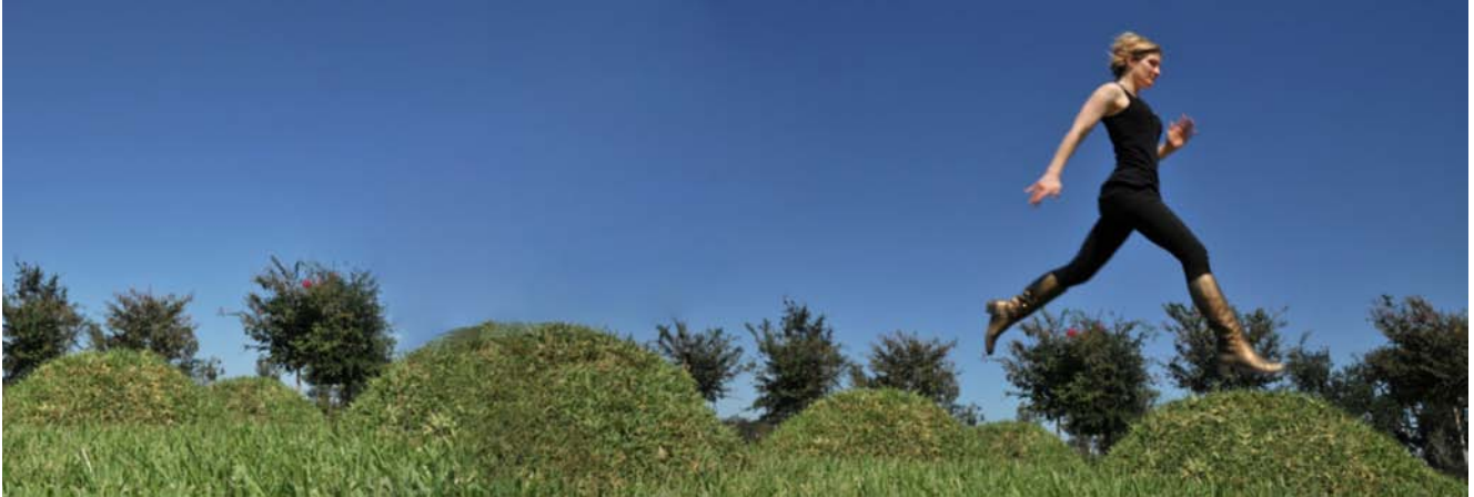
welcome 2009 Grass and soil. 15.5x104'. City Park, New Orleans