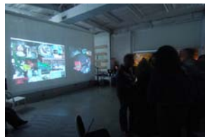
from Spring 2009 (4 images) Documentation of participatory work