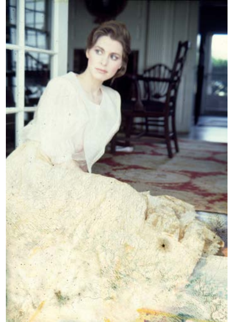
Doorway II (from Spring) 2009 Digital C-print on glossy paper. 20x30"

In addition to the prints, a memory collage was built through the process of scanning and projecting documents and items provided by those who attended. This collage incorporated the attendees' meaningful objects to form a connection between these individuals.