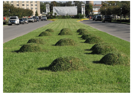
welcome 2009 Grass and soil. City Park, New Orleans

Gochman's welcome , installed in the Lelong Drive esplanade leading to the New Orleans Museum of Art, greeted thousands of visitors to The Voodoo Experience 2009. welcome is a series of raised, grass covered mounds spelling out the word "welcome" in Braille. Reminiscent of Peru's Nazca lines, whose patterns are discernible only from the air, the size of the Braille pattern in welcome - 104 feet long - transforms a single word into an environment.