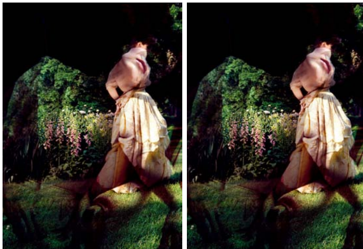
Foxglove (from Layered) 2009 63x43" Digital C-print on glossy paper. 30x43" Inkjet pigment print on cotton rag. 30x43"