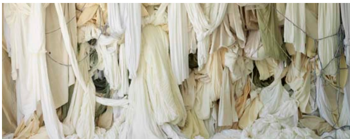
Fabric Wall (from Lullabies ) 2010 Photographic wallcovering. 384x144"