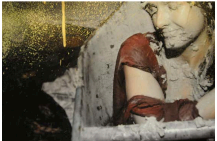
O Naturale 2008 Photographic print & body spray

“I create environments and experiences,” explains Gochman. “This is my way of communicating what I cannot come close to expressing in