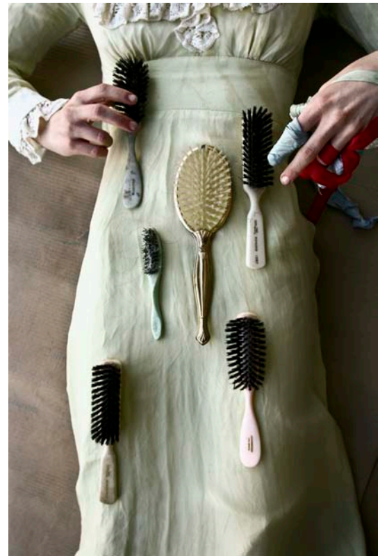
Brushes (from Lullabies ) 2008 Inkjet pigment print on cotton rag. 40x60"