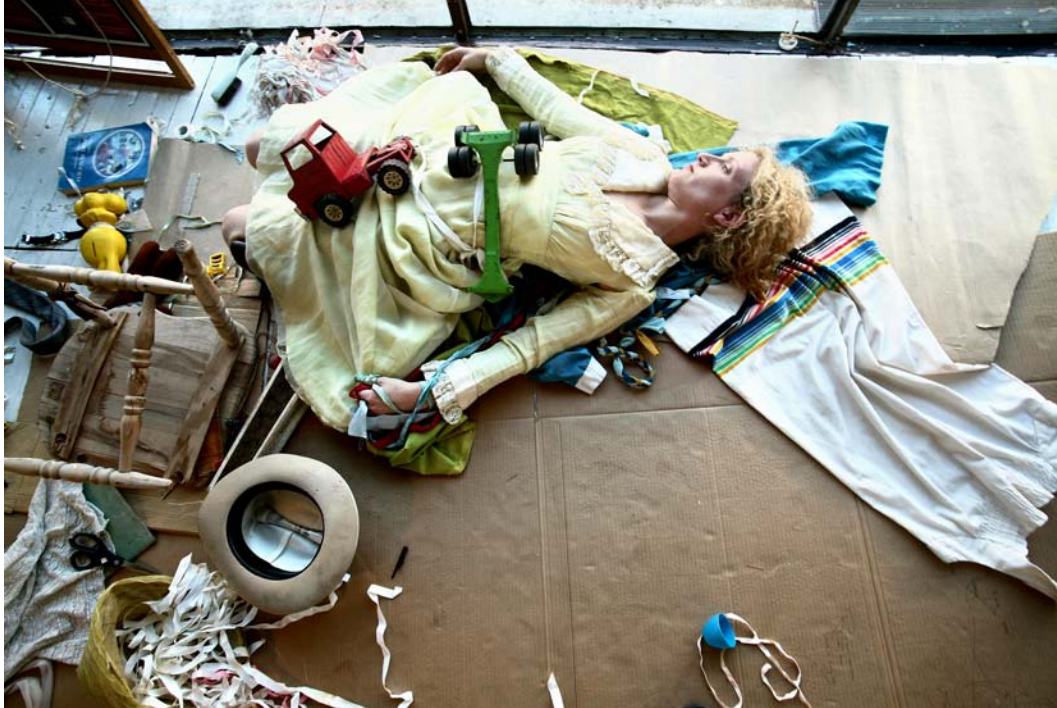
Foundation (from Lullabies ) 2008 Inkjet pigment print on cotton rag. 60x40"