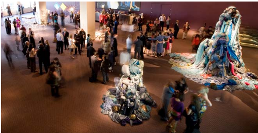
Waterfalls Wept 2008 Fabric, brass, copper, & wood