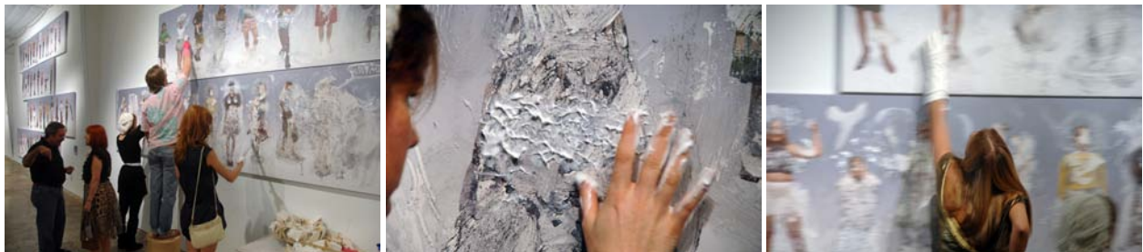
from Release: Give-Away III 2008 (3 images) Documentation of participatory work

For Release: Give-Away III (2008), Gochman encouraged attendees to physically alter the prints by using cleansing tools and body lotion to wipe away portions of the images. Participants demonstrated individual preference through changes they made to the works and had the opportunity to connect with the prints and each other.