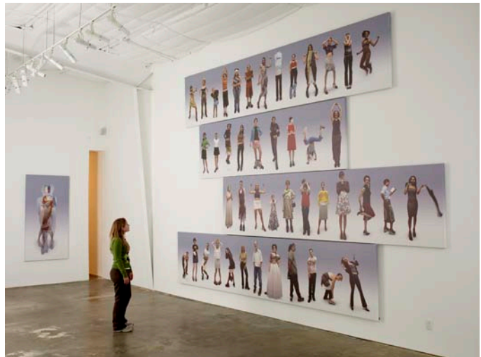
from Give-Away Project Part II 2006 Exhibition

For Release: Give-Away III (2008), Gochman encouraged attendees to physically alter the prints by using cleansing tools and body lotion to wipe away portions of the images. Participants demonstrated individual preference through changes they made to the works and had the opportunity to connect with the prints and each other.