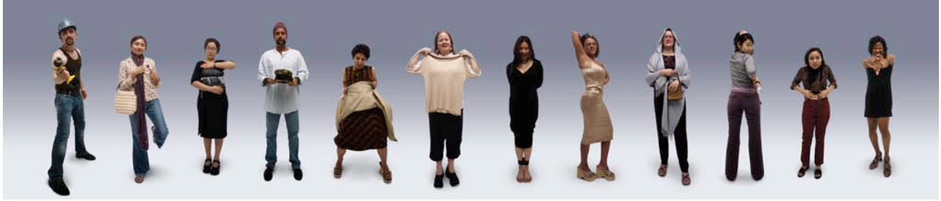
C# / E 2003 Photographic print on canvas. 156x38"