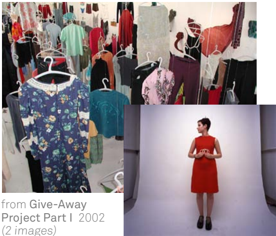
from Give-Away Project Part I 2002 (2 images) Documentation of participatory work

For Give-Away Project Part I (2002), Gochman gave away 95% of her personal clothing to exhibition attendees in exchange for photographing each clothing recipient in the outfit of his or her choice. The resulting photographs were later exhibited in Give-Away Part II (2006).