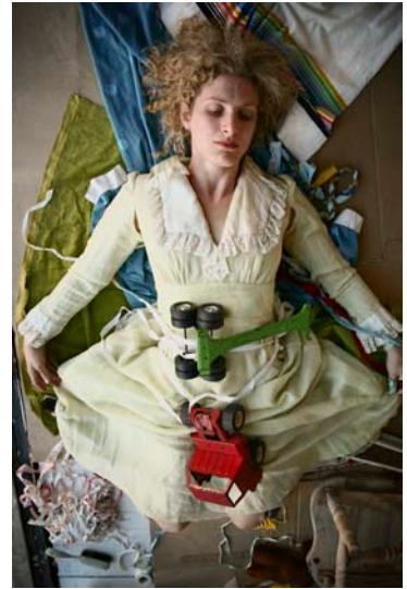
Topography of a Town (from Lullabies) 2008 Inkjet pigment print on cotton rag. 40x60"

Private collections in Dallas, Houston, and San Antonio, TX, Sydney, Australia and New York, NY