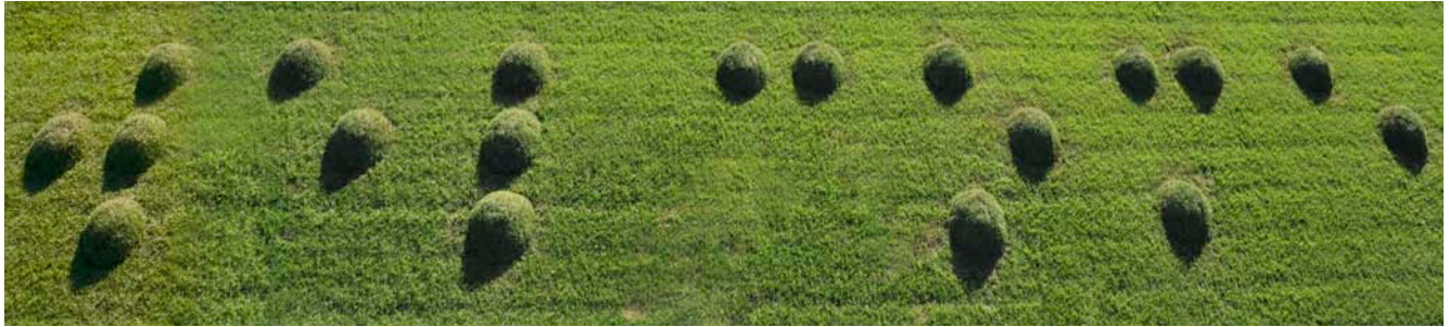
welcome 2009 Grass and soil. 15.5x104'. City Park, New Orleans