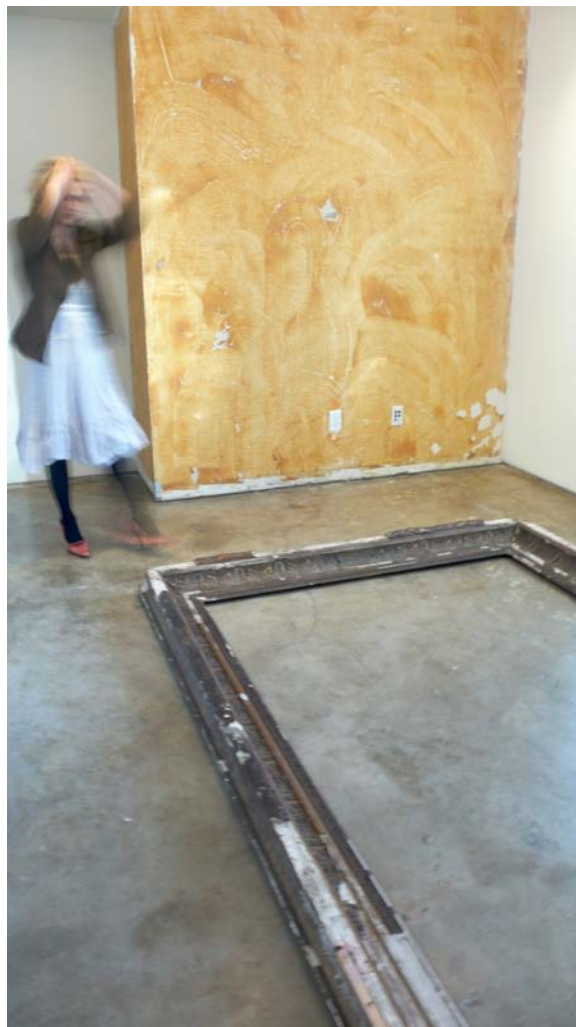
Framing the Foundation 2008 Documentation of installation. 71x96”

I hope that the person who experiences my work feels welcomed to go from the work into his or her own contemplation of what the work inspires in them. In a sense, the works are only half-done when I complete my work on them. They are invitations to experience, and it’s up to each person who comes into contact with them to decide how – or if – to accept that invitation.”