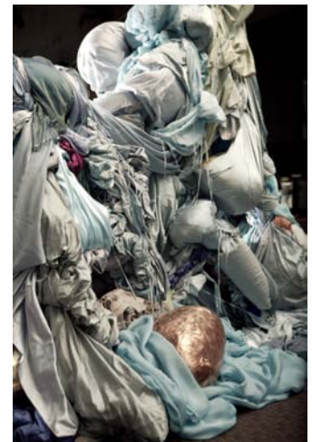
Waterfalls Wept 2008 Fabric, brass, copper, & wood

One of the inspirations for this work was a translation of the Hindu epic, The Ramayana . When Sita, an avatara of Lakshmi, is kidnapped, the earth responds - "and the waterfalls wept." The tale of The Ramayana , which can be traced back 880,000 years, makes the 2,500 year-old Tao Te Ching young in comparison. The Tao Te Ching states, "Nothing is more soft and yielding than water. Yet for attacking the solid and strong; it has no equal." Fabric, one of Molly Gochman's primary media, is used to transform surfaces into gurgling landscapes. Fabric is flexible and strong. Its strength relies mostly on a repetition of contrasts, warp and weft. Creating fabric is one of human's earliest technological achievements, and the use of this material continues today. Using fabric as a means of protecting and identifying ourselves provides us with a tactile connection to the past, present, and future. For Waterfalls Wept , Gochman attached bolts of fabric to five A-frame wooden ladders, which stretch in various directions within a space. Pillows and batting soften the ladders' angles which remain hidden under the ripples of blues that fold, flex, and fall from the forms. Waterfalls Wept was first displayed at Lincoln Center at a show concerning gender and sexuality in South Asian cultures.